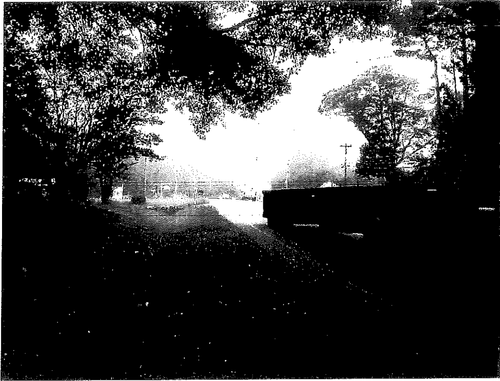
Looking west from site toward downtown, June 13, 2018.