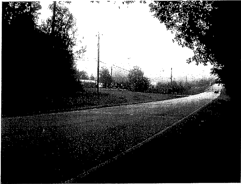
Looking east toward I-85 from project site, June 13, 2018. City of LaGrange natural gas transfer station to the left, on north site of SR 54