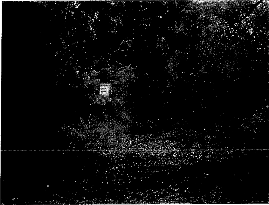
Project site, looking south toward house, June 13, 2018